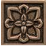
DECAMBROM22 • 2" x 2" Romanesque *