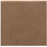
DECAMBPRO22 • 2" x 2" Promenade