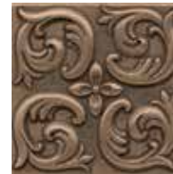
DECAMBWAV44 • 4" x 4" Wave * Not available in "N"