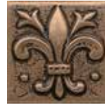
DECAMBFLO22 • 2" x 2" Flor-de-Lis *