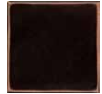
Venetian Bronze - (V)