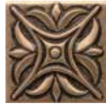
DECAMBRIS22 • 2" x 2" Rising Star *