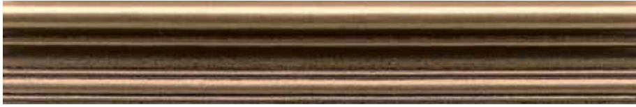
DECAMBCHAIR • - 2" x 12" Chair Rail