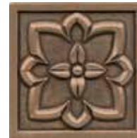
DECAMBROM44 • 4" x 4" Romanesque *