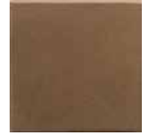
Bronze - (B)