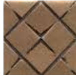
DECAMBMAT22 • 2" x 2" Matrix City