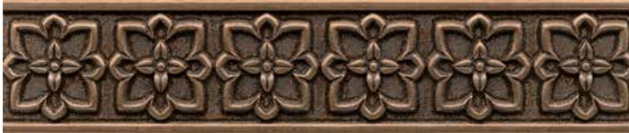
DECAMBROMAN • - 2 1/2" x 12" Romanesque Liner *