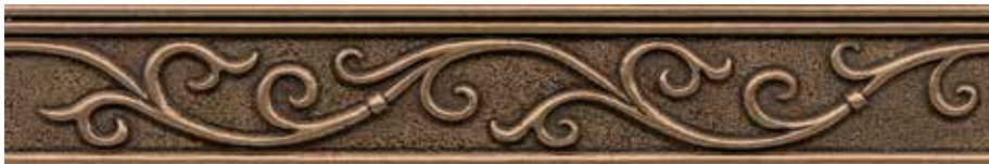
DECAMBGOTHIC • - 1 3/4" x 12" Gothic Leaf Liner *