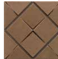
DECAMBMAT44 • 4" x 4" Matrix City