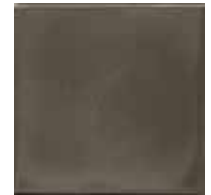
Brushed Nickel - (N)