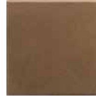
DECAMBPRO44 • 4" x 4" Promenade