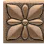
DECAMBJAS22 • 2" x 2" Jasmine Flower *