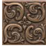
DECAMBWAV22 • 2" x 2" Wave *